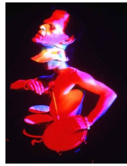
Dudley Moore 1960 (rt): Beyond the Fringe

17:00 Free time; dinner on your own, or join an affinity group (sign up at registration desk).